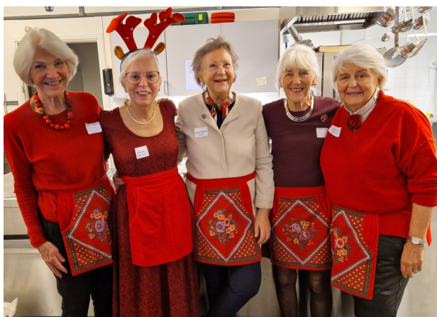
The Monthly Meeting Committee minus Gunnel Anita Solheim).