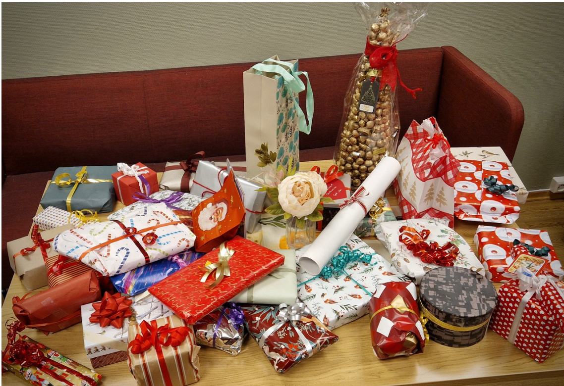
The raffle prizes.

The Monthly Meeting Committee worked hard as always to ensure that everything went smoothly. A big Thank you! from us all. The raffle brought in NOK 4250 which will be donated to the Atlas Alliance, an umbrella organisation of various charitable organisations working to promote the rights and living conditions of persons with disabilities in the Global South.