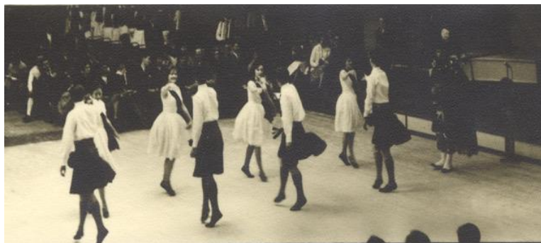
Scottish country dancing