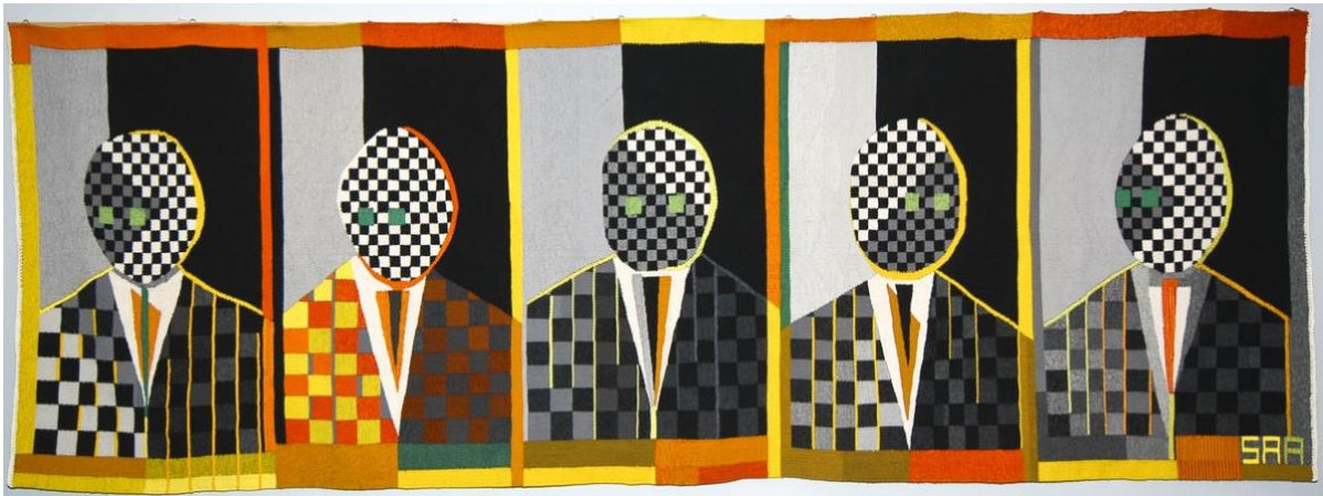
Even more bureaucrats

engaged, something that can be seen in many of her works of art, e.g. Enda flere byråkrater (Even more bureaucrats) and 'October Gossip'. Her dedication to the struggle for women's rights can be seen in From Dark to Light .