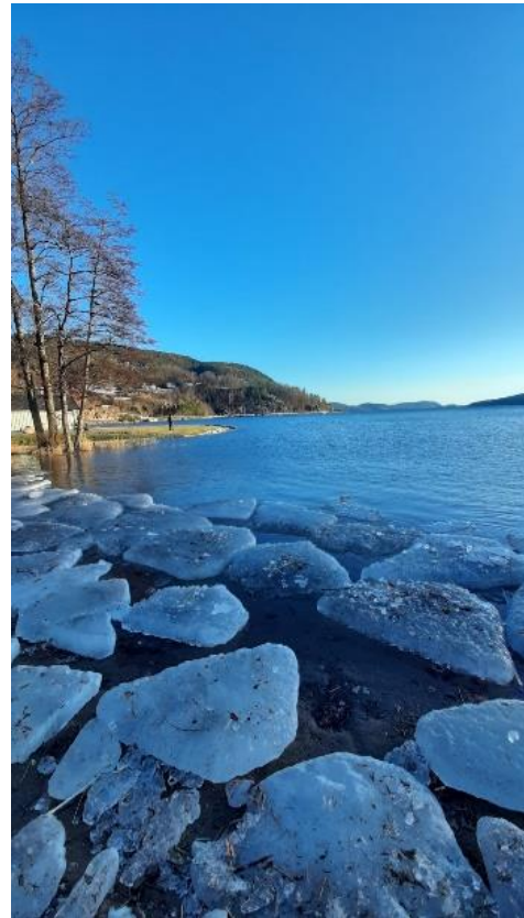
Enjoying the Blue Light