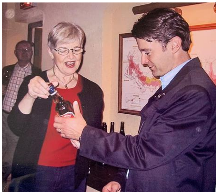
Visiting Louis Jadot in Burgundy