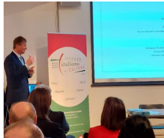
EU Ambassador Nicolas de la Grandville

We have been portrayed as being more rigid than the European Commission and called ‘holier than the Pope’. This is always a difficult balancing act notably in political sensitive areas and reflecting the fact that not everyone in Norway is in favour of the EEA Agreement.