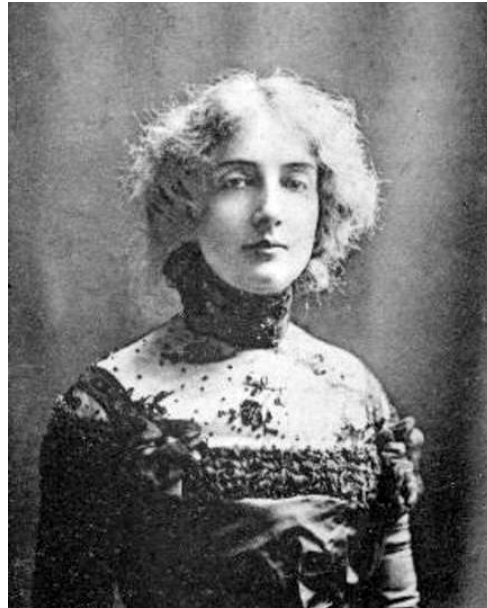
Dagny Juel (1867-1901)