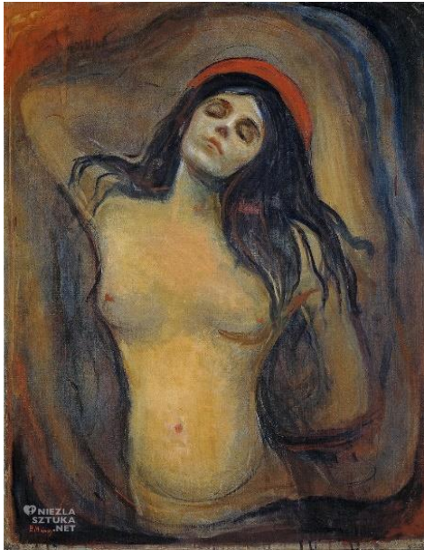
Madonna – Edvard Munch

Ambassador of Georgia to the Kingdom of Norway