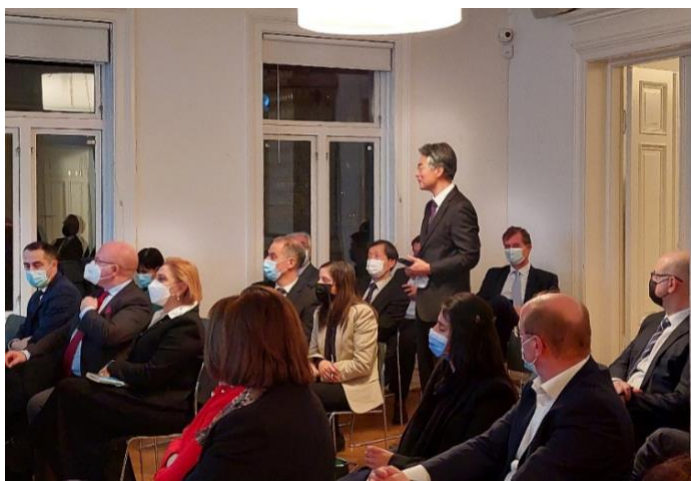
Korean Ambassador Kim Pil-Woo

Fisheries and agriculture are outside the Agreement's scope, except for veterinary regulations. ESA conducts comprehensive veterinary inspections in close cooperation with the Commission. ESA also conducts inspections of ports and airports. We employ people from 18 countries within the EEA. Apart from giving priority to handling the pandemic, climate change is at the core of ESA's work. We monitor the implementation of the Paris Accord in Iceland and Norway in close cooperation with the Commission and using the same modalities as applied to the EU countries.