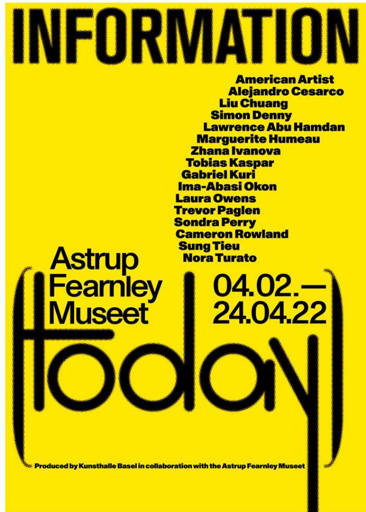
Some of the artists

INFORMATION (Today) is a group show featuring contemporary artists seeking to unravel this phenomenon.