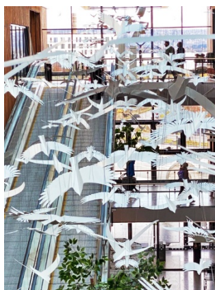
Fornebu Senter

This is a group for amateur photographers. No special qualifications are required, just an interest in learning about digital photography. We organise 6-8 workshops annually. For the time being, we have the workshops online, on Zoom.