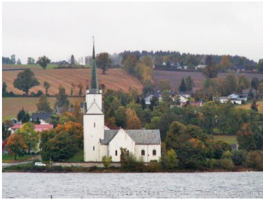
The medieval church at Nes

reaching the forests south of Lillehammer. That's when the second seating starts.