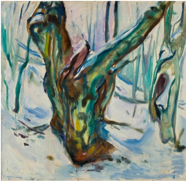
‘Tortuous tree in the snow’

meets the force and wildness of nature. For Munch, the forest was not only a place where something ended, but it was also a place where something began.’