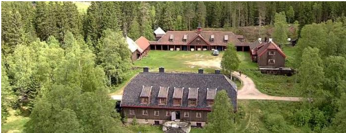
The Hunting Lodge

More details about this exciting trip, and the signing up instructions, will appear in the August Newsletter . Please note the date: Tuesday, September 19 , and be prepared to sign up!