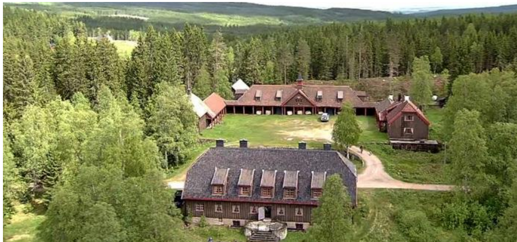
The Hunting Lodge