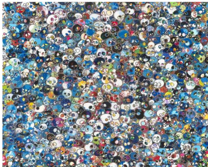
Takashi Murakami, Blue Life Force (2012) ©Takashi

The Art Committee is pleased to invite you on a guided tour at the Astrup Fearnley Museum of Modern Art on February 14 .