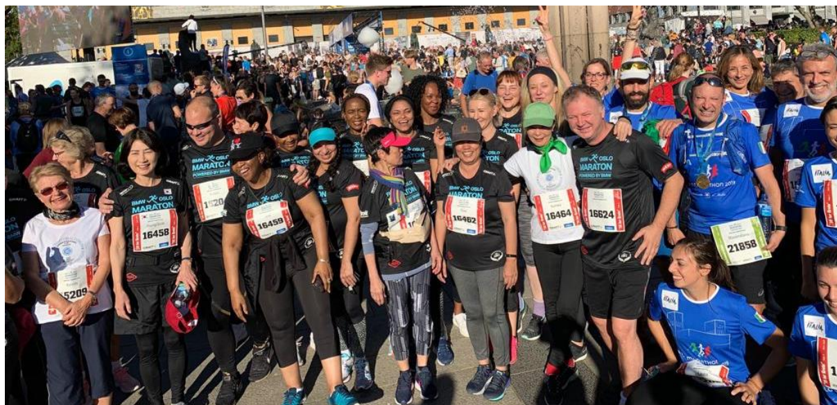
Some of the 50 happy Ambassadors for Peace Team runners.

It was a marvellous day in every way and a good time was had by all.