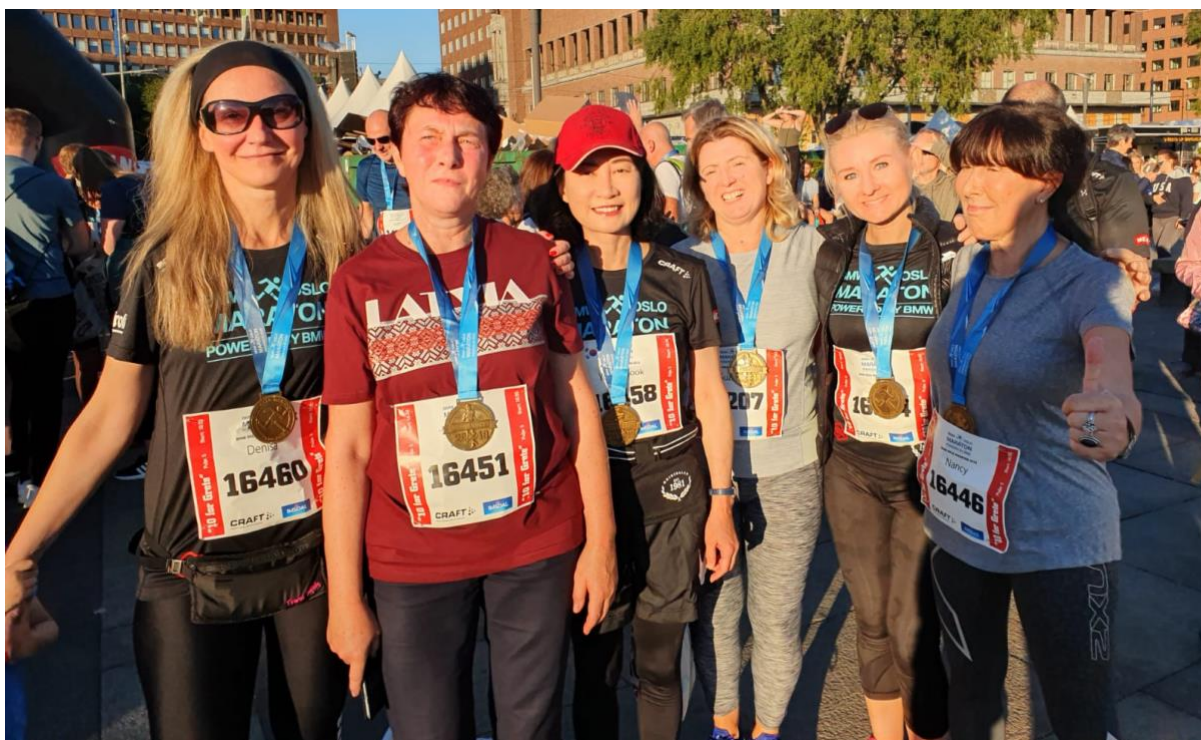
The Ambassadors of Slovakia, Latvia, Korea, Serbia, Bulgaria and Belgium enjoyed their 'Noble Peace Prize Medal' after completing the run.