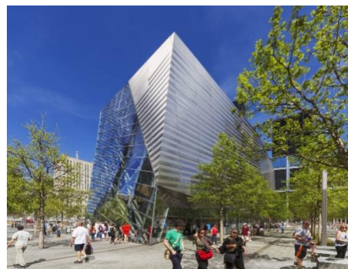
The September 11 Memorial Museum Entrance Building by Snøhetta

The firm began as a collaborative architectural and landscape workshop and has remained true to its trans-disciplinary way of thinking since its inception. Snøhetta seeks to enhance our sense of surroundings, identity and relationship to others and the physical spaces we inhabit. Museums, products, reindeer observatories, landscapes and dollhouses all get the same care and attention to intended use and function.