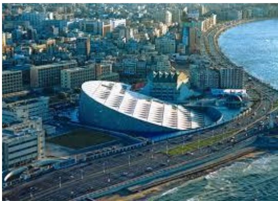
The Alexandria Library

The members of the International Forum are cordially invited to visit the premises of one of the world's most famous architecture firms, Snøhetta. We will visit the production rooms, where innovative architecture, designs and landscapes are created.