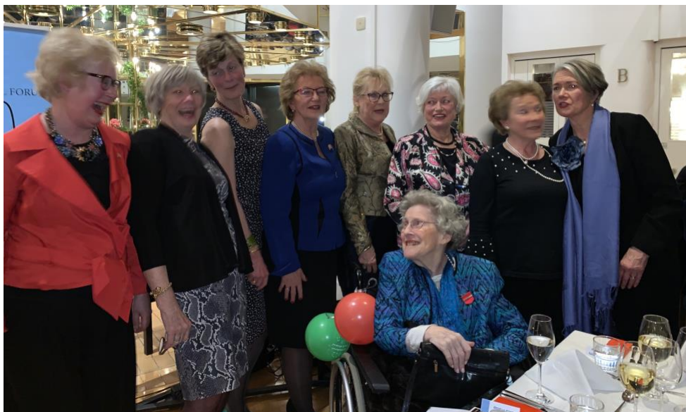
Current and past presidents of the International Forum