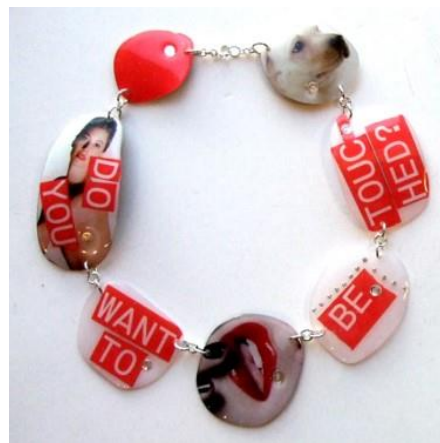
Do you want to be touched?

If time permits you can also visit the outdoor sculpture project, Wildlife. We plan to visit the following 3 artists: