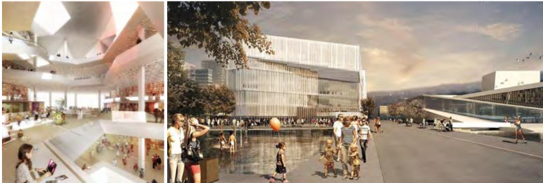
Deichman: the new Oslo City Library by Lund Hagem Architects & Atelier Oslo

Lund Hagem provides architectural and urban design services to both the public and private sectors. Their diverse portfolio includes a wide range of building projects, such as private villas and leisure homes, libraries and educational facilities, apartment buildings, offices and commercial facilities. The company has won numerous prestigious competitions and received a number of awards and citations for excellent design. Lund Hagem Architects is based in Oslo.