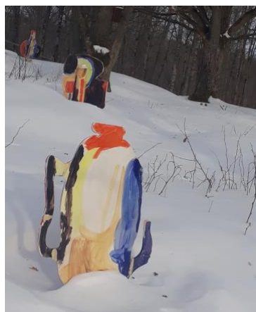
Sculpture in snow

The Art Committee would like to invite you to Nesoddparken Kunst- og Kulturnæringscenter [Nesodden art and commercial condominium] where as many as 50 artists have studios, workshops and offices. The building is surrounded by a large park area with sculptures, small paths, benches and a greenhouse.